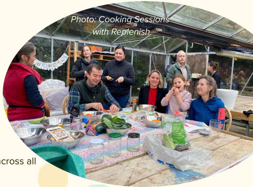
Photo: Cooking Sessions with Replenish