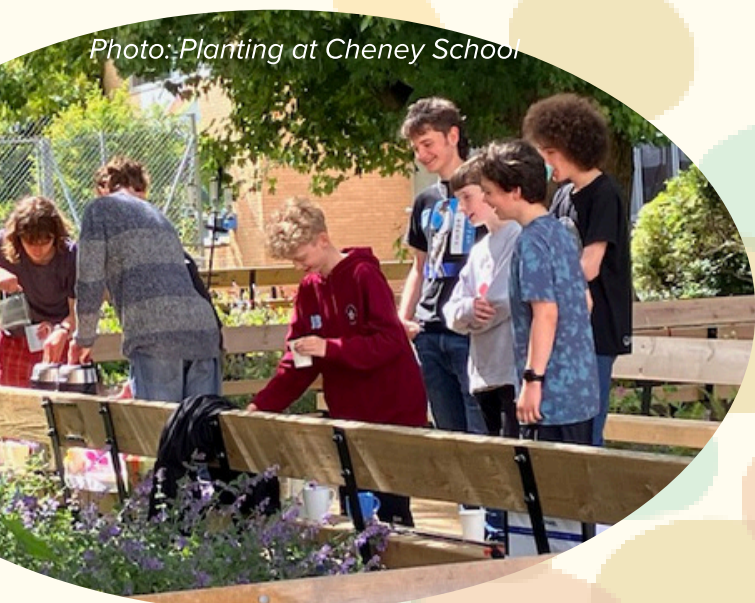
Photo: Planting at Cheney School

Supporting nature's recovery is a focal area for many CAG members, with over 50 groups working to monitor, enhance and protect nature in their areas.